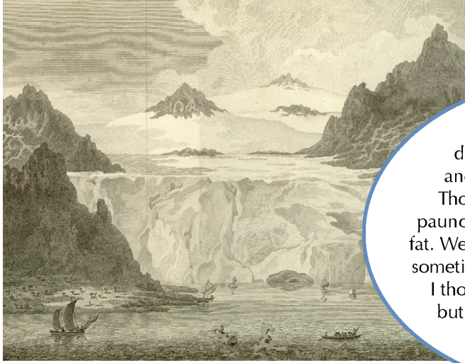
View of an iceberg from "A Voyage to the North Pole" by Captain Phipps, 1774