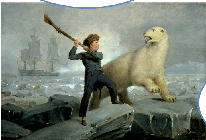
This painting by Richard Westall in 1809 imagines a scene where the 14 year old Horatio Nelson fights off a polar bear.

We sawed some of the ice about the ships ... while we were at this hard labour I once fell into a pond we had made amongst some loose ice, and was very nearly drowned.